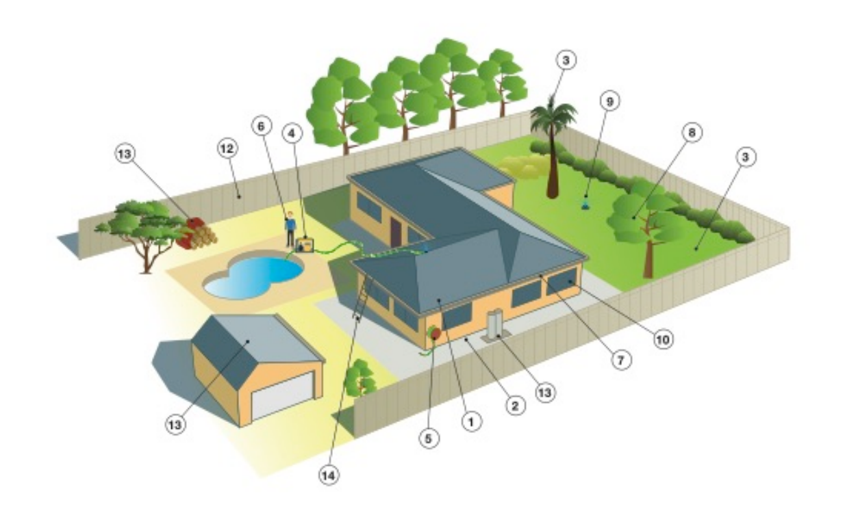
Figure 3: Protecting your home – a suburban property

There are also steps you can take to prepare your home in the case of an approaching bushfire. These are shown in Figures 3 and 4.